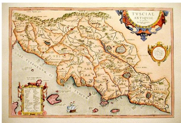
Grand Duchy of Tuscany